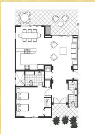
1 Bedroom Condo (lockoff) 1181 sqft. interior, 228 sqft. exterior

On an exotic Caribbean Island just off the Northwestern Coast of Panama, Red Frog Beach is offering some of the nicest accommodations in Central America. These ocean condos overlook the gorgeous Caribbean sea and vast tropical forest.